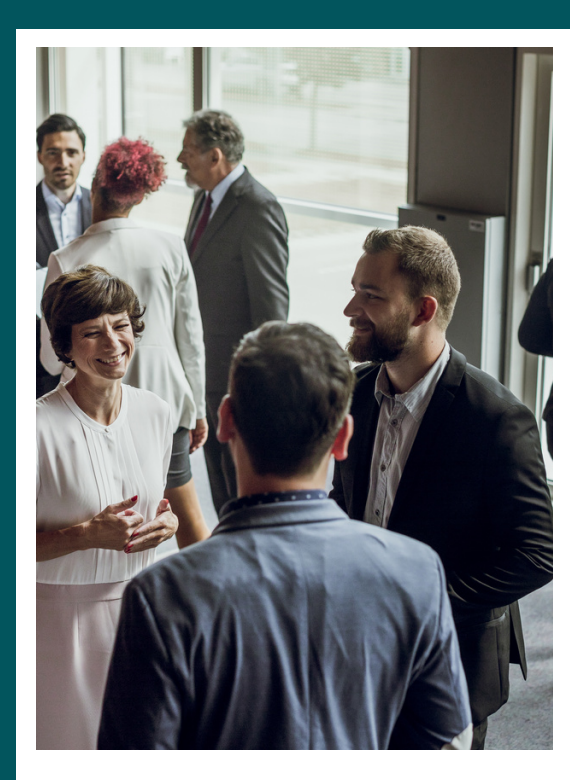
RECOGNITION AT OUR EVENTS

LOGO DISPLAYED ON OUR WEBSITE AND OFFICAL BROCHURES OR COLLATERALS.