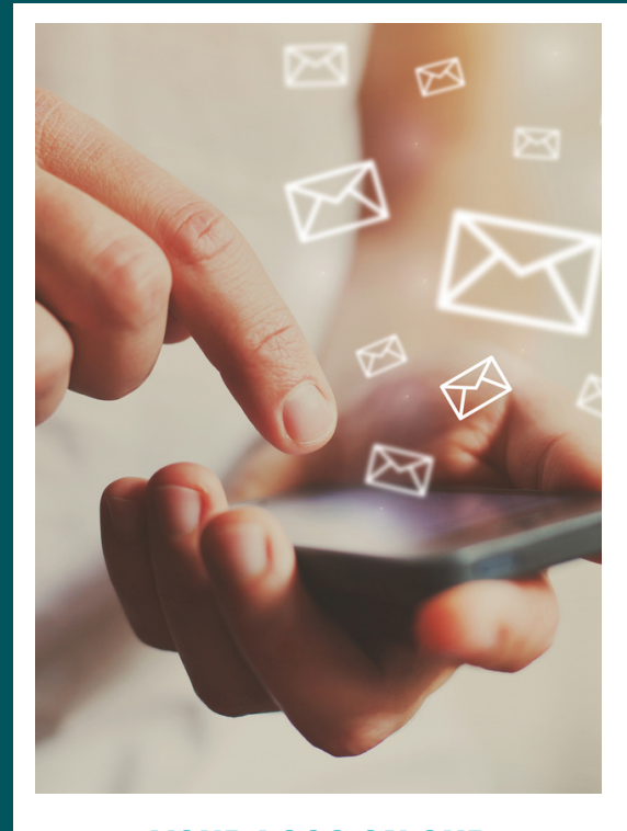
YOUR LOGO ON OUR NEWSLETTERS